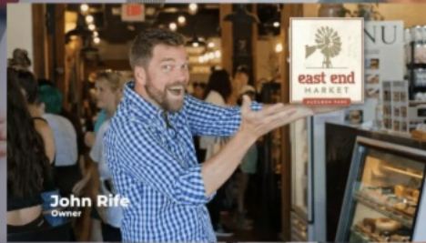
East End Market / John Rife, Orlando, FL S11 Ep4 | 26m 46s